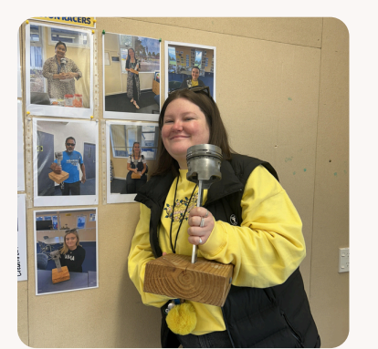
Staff Winners of the Piston